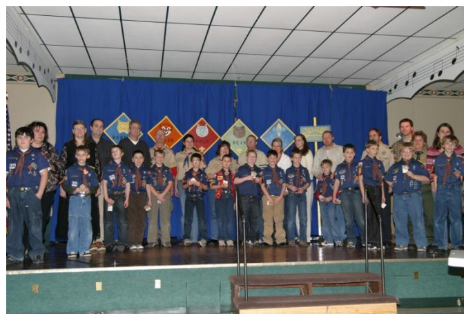
Webelos I Den